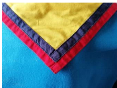
Our Group scarf

When a young person is invested, they are formally welcomed into the Scouting family. They need to make their Scouting Promise and will be given their Group scarf (also known as a neckerchief or necker) along with badges to go on their uniforms showing they are a member of the Group, as well as a member of the wider Scout District and County.