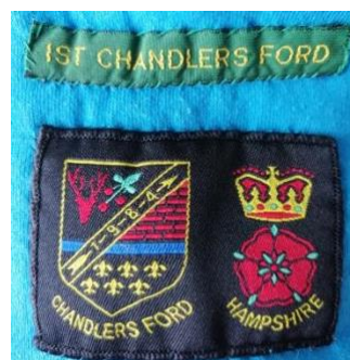
Group name, District (Chandlers Ford) and County (Hampshire) badges