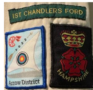
Group name, District (Chandlers Ford) and County (Hampshire) badges