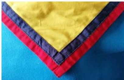
Our Group scarf

When a young person is invested, they are formally welcomed into the Scouting family. They need to make their Scouting Promise and will be given their Group scarf (also known as a neckerchief or necker) along with badges to go on their uniforms showing they are a member of the Group, as well as a member of the wider Scout District and County.